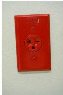
Braun 120 b.jpg