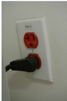
Braun 120 a.jpg

Braun is equipped with emergency power. Outlets providing emergency power can be identified by red markings. See images below for examples of emergency power outlets.