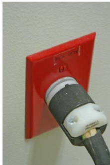
Braun 208 b.jpg